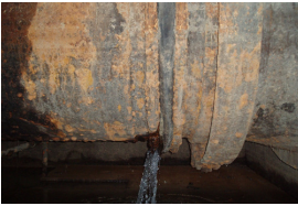
Expansion joint replacement can be costly and time consuming