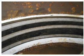
Internal Seal with Backing Band Installed Over Convolution